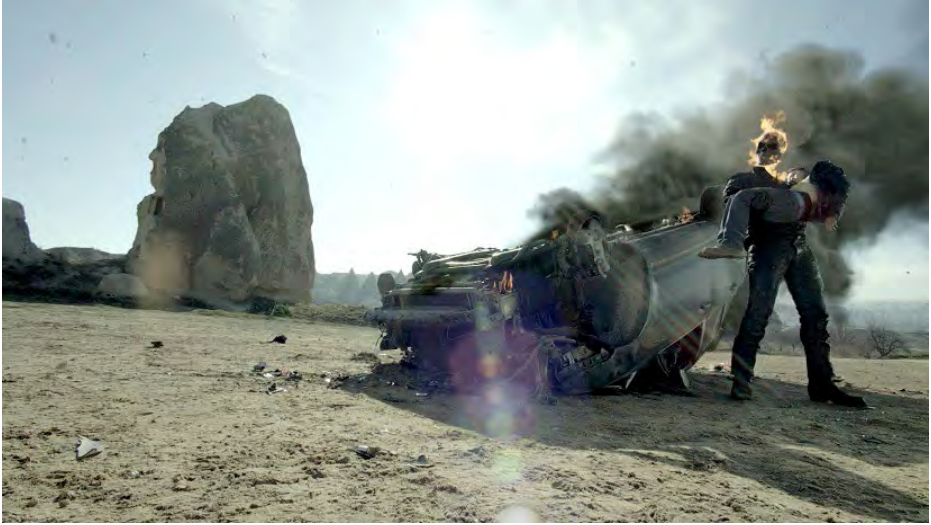
Figure 2 – Directors Mark Neveldine and Brian Taylor use CGI lens-flares to push the limits of 3D in GHOST RIDER: SPIRIT OF VENGEANCE (2011).

flare emphasizes the plastic reality of “pro-filmic” CGI objects; the virtual camera, which enables our view of these objects, is to this extent itself grafted onto the subjective pole of the intentional relation, “embodied” or “incorporated” in a sort of phenomenological symbiosis that channels perception towards the objects of our visual attention. [9] On the other hand, however, the lens flare draws attention to itself and highlights the images’ artificiality by emulating (and indeed foregrounding the emulation of) the material presence of a (non-diegetic) camera. To this extent, the camera is rendered quasi-objective, and it instantiates what Ihde calls a “hermeneutic relation”: we look at the camera rather than just through it, and we interpret it as a sign or token of verisimilitude or “realisticness.” [10] The paradox here, which consists in the realism-constituting and realism-problematizing undecidability of the virtual camera’s relation to the diegesis—where the “reality” of this realism is conceived as thoroughly mediated, the product of a simulated physical