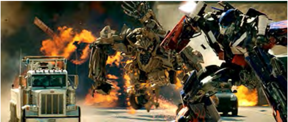
Figure 7 – The central spectacles of TRANSFORMERS (Michael Bay, 2007) are “hyperinformatic” images that outstrip human perception.

spectacle of Michael Bay’s Transformers series—a series that is clearly full of hectic, non-continuity editing patterns—demonstrates this essentially secondary role of formal editing (see Figure 7, below). The transformations themselves embody a certain outstripping of human perceptual faculties, dis correlations that are staged in continuous takes, without the need for explicit violations of continuity. These transformations offer concise examples of a “hyperinformatic” cinema: they overload our capacities, giving us too much visual information, presented too fast for us to take in and process cognitively—information that is itself generated and embodied in informatic technologies operating at speeds well beyond our subjective grasp. Hence, the transformation’s visualization does not simply produce images that give objective form to boys’ and men’s childhood fantasies and playtime imaginations; instead, it is precisely their failure to coalesce into coherent objects that defines these images as metabolic “spectacles beyond perspective”—i.e. as ostentatious displays that categorically deny us the distance from which we might regard them as perceptual objects. It is the processual flow and speed of algorithmic processing that is put on display here, and indeed put into effect as the images are played back on our computational devices.