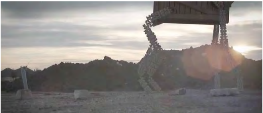
Figure 8 – Unexplained CGI images challenge us to scan the frame for information in UPSTREAM COLOR (Shane Carruth, 2013).

dynamics, the micro- and macro-levels and confusions of within and without, in an audiovisual and narrative construct that displaces centered human perception in both directions at once. Upstream Color is about agencies that infiltrate the body, but that remain ecologically distributed throughout a network of hosts and environmental transport mechanisms: a river, plants, pigs, people, power lines, music, and money—all of these carry and are in turn carried by the parasitic maggots at the center of a story ostensibly about a couple, ruined professionally, financially, and perhaps psychologically, as they find their way to one another and ultimately to a greater sense of connection with the world. I say that it is “ostensibly” about this, but it is certainly about much more than this. I hesitate, however, to offer an “interpretation” per se, as narrative and signifying functions seem secondary to the experience the film propagates, both diegetically and medially, of indissoluble and multidirectional interlinkage—an experience, in short, of metabolism as the sub-perceptual nexus of growth and decay. (I wish to say that the film offers us an experience of metabolism itself, not a metaphor for metabolism. [25])