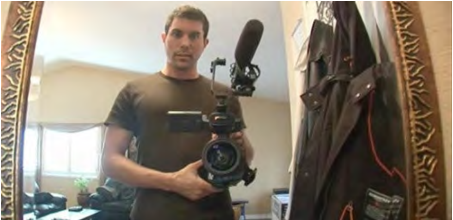
Figure 3 – Hand-held cameras mediate between diegetic and extra-diegetic spaces in PARANORMAL ACTIVITY (Oren Peli, 2007/2009).