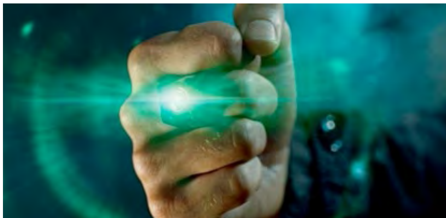
Figure 1 – CGI-generated lens flares underscore (but exceed) diegetic realities in GREEN LANTERN (Martin Campbell, 2011).

perceptual correlation is endangered by new—or “postcinematic”—media (as she already referred to them in 1992), which disrupt the commutative interchanges of perspective upon which filmic experience depends for its meaningfulness.[7] With the tools Sobchack borrows from philosopher of technology Don Ihde, we can make a first approach to the “crazy” quality of post-cinematic cameras and the disrelation of their images.