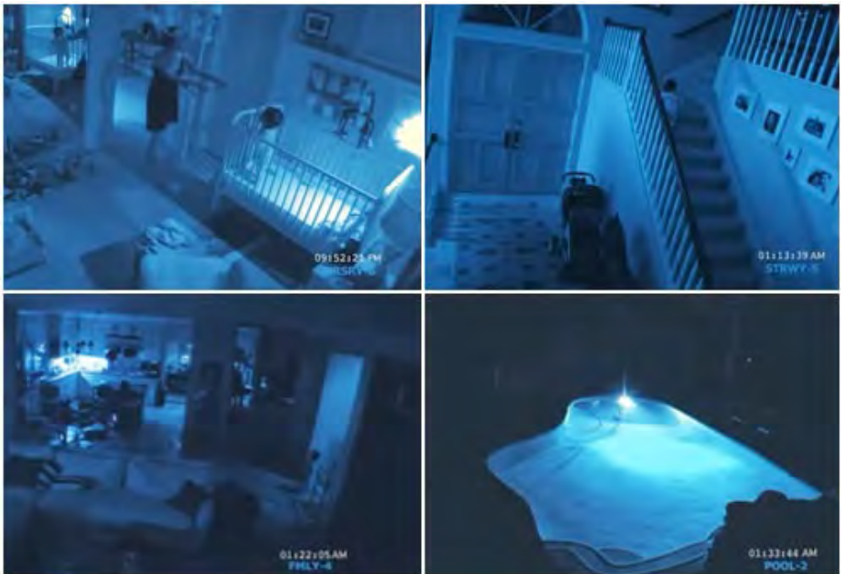
Figure 4 – Closed-circuit home surveillance cameras capture the action in PARANORMAL ACTIVITY 2 (Tod Williams, 2009).