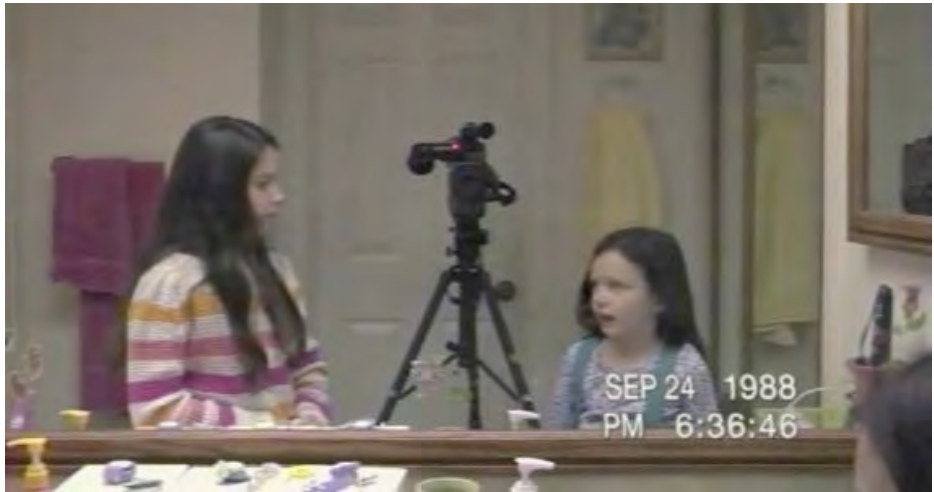
Figure 5 – PARANORMAL ACTIVITY 3 (Henry Joost and Ariel Schulman, 2011) presents itself in the form of VHS found footage.