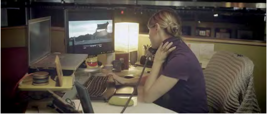
Figure 9 – Female protagonist Kris (Amy Seimetz, UPSTREAM COLOR ) shares our perspective with regard to the post-cinematic vision machine.

relationship develops. Their childhood memories merge, and it is unclear whose past belongs to whom. Moreover, this erasure of individual identity, the overt emergence of what Deleuze calls “dividuality,” is mediated through free-floating dialogues that attach themselves to various locales and various times, impossibly bridging spatial and temporal distances that no embodied speaker could span. [26] So what sometimes resembles a Terrence Malick-style voiceover is in fact something quite different, as it is occasionally anchored in an image of a character speaking in one place, but that speaking character can disappear and reappear at a distant location within the space of a single ongoing dialogue, itself apparently presented in real time. We are in the realm of the virtual rather than the actual, it would appear, and the flow of images and sounds effectively involves the viewer in the dispersal of agency described in the diegesis. [27]